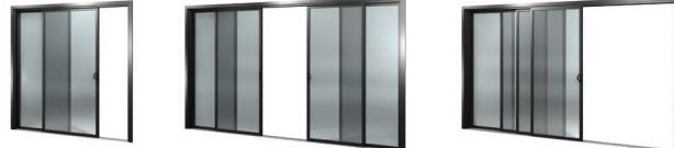
Single slider Double slider Stacking slider