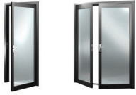
Single door French doors